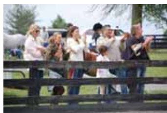
Sunny's Corner, Middleburg

Feedback from visitors was similarly positive and expressed enthusiasm for the farm tour and the variety of activities available on the tour (see page 3).