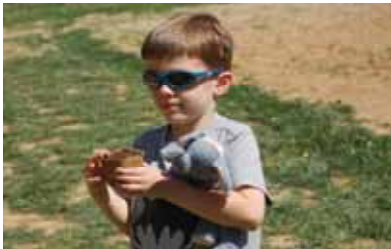
Planting a pumpkin to take home at Ballentine Farm, Waterford

Great music, good cheer by all- we will return, many times before fall.