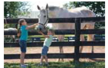
Chase Run Stable, Purcellville