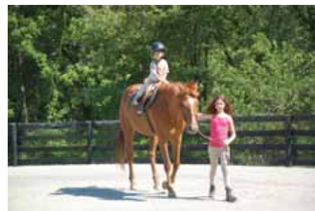
Pony rides at Chase Run Stable Hamilton