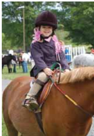
A very young competitor at the Sunny's Corner Horse Show in Middleburg

The Department of Economic Development also distributed 5,000 additional copies, made in-house copies to provide the regional libraries and participating farms, and gave Visit Loudoun 2,000 additional addresses for out-of-town requests for the publication. Feedback from two farm participants on the brochure was that their visitors had not seen the Buy Fresh Buy Local Guide, and that they preferred the original farm tour brochure as it was “a good size and more appealing than the Buy Fresh insert.”