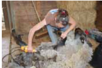
Sheep shearing at WeatherLea Farm & Vineyard, Lovettsville