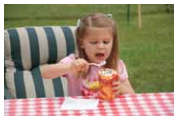
Enjoying strawberry sundae at Wegmeyers Farm in Hamilton

Signage included flyers posted at the Leesburg Flower and Garden Show and at several stores in the Leesburg area. Over 100 directional signs were installed the week prior to Farm Tour weekend and removed immediately following the tour. Farm Tour information was also available at the Leesburg and Purcellville farmers markets, as well as the DuPont Circle farmers market. Individual farms were encouraged to publicize their participation in the Spring Farm Tour.