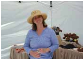
Wool shop at Butterfly Hill Alpacas Waterford