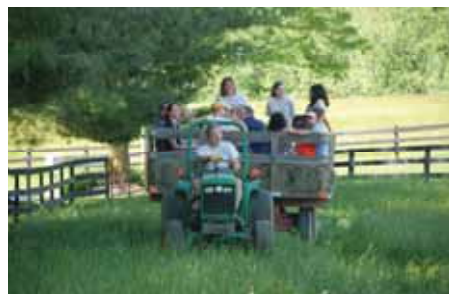
Hayrides at Ballentine Farm, Waterford