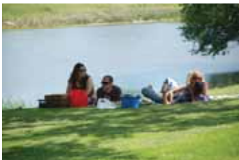
Relaxing at Corcoran Vineyards Waterford