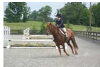
The horse show at Sunny's Corner, Middleburg

...“we were VERY pleased with the turnout, and the sales we had ...”