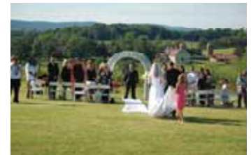
A wedding at Loudoun Valley Vineyards, Waterford